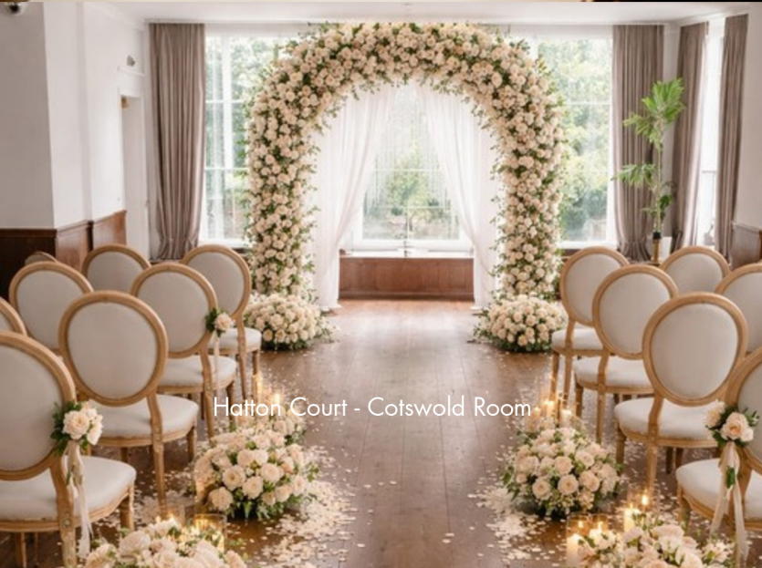
Hatton Court - Cotswold Room

Whether you're dreaming of timeless romance or modern sophistication, we'll help you find the perfect setting to celebrate your first meal as newlyweds.