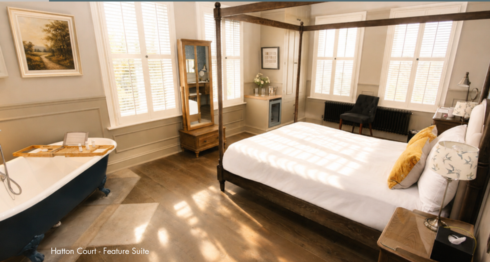
Hatton Court - Feature Suite